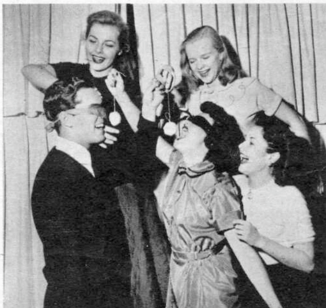
What now? Looks like peeled apples to us, but with this happy-go-lucky group one never can tell. Onions? Oh, we doubt it.