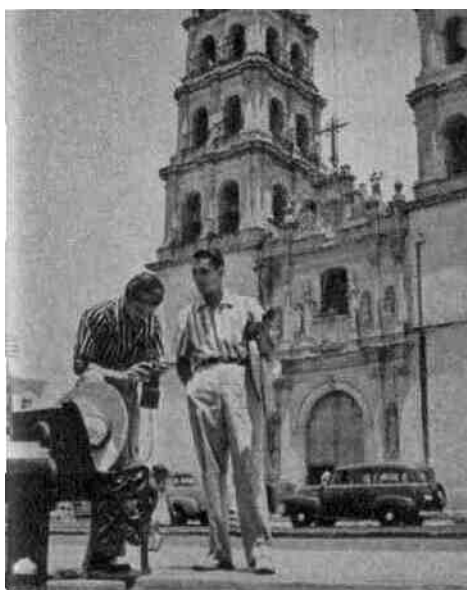
Their Rolleis get workouts as they reload for more pictures