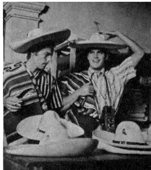
The boys go native; buy sombreros, but skip the gay sarapes