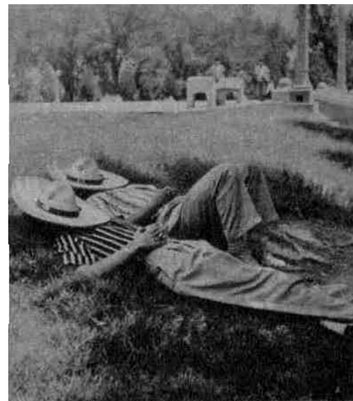
Siesta time. The end of a wonderful trip through Durango