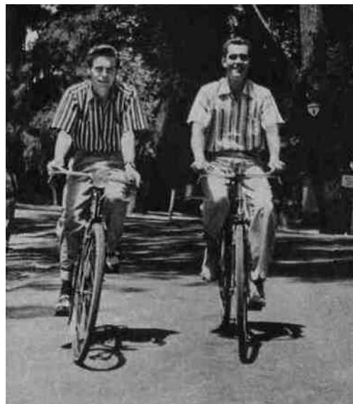
Renting bikes, they're off on their own de luxe tour