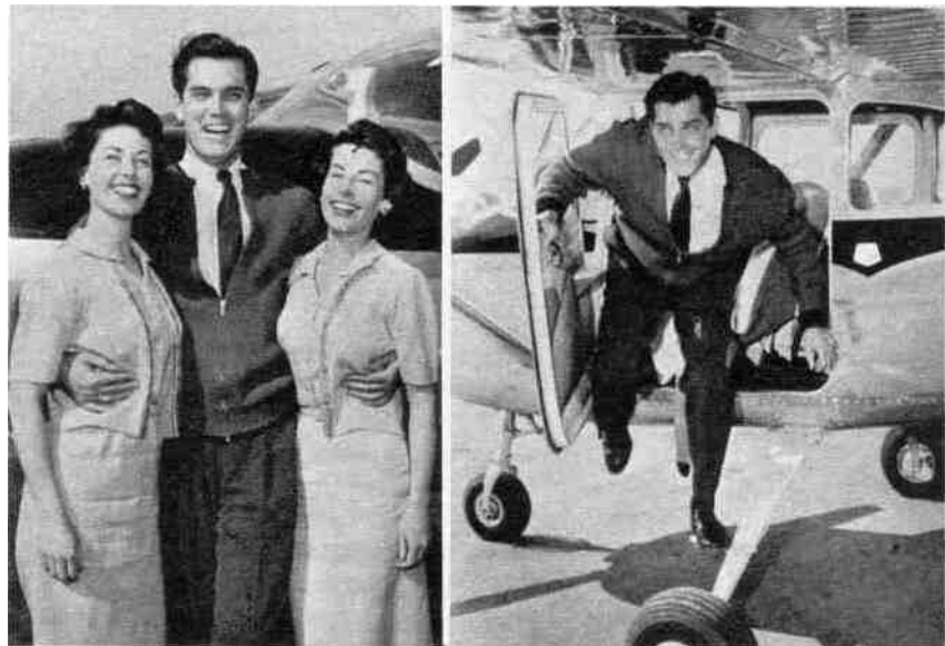
When Jeff's career hit slump, he wisely decided to use free time to conquer new fields including flying (those are his pretty flight instructors at left). As result, to-day he has richer, fuller, happier life plus his once-again booming film career.

At the time, a friend advised Jeff to play it "smart," to forget that Bob Wagner was a friend and to make a campaign to sell himself for the "Prince Valiant" role. Jeff refused to do this. He ( Please turn to page 81 )