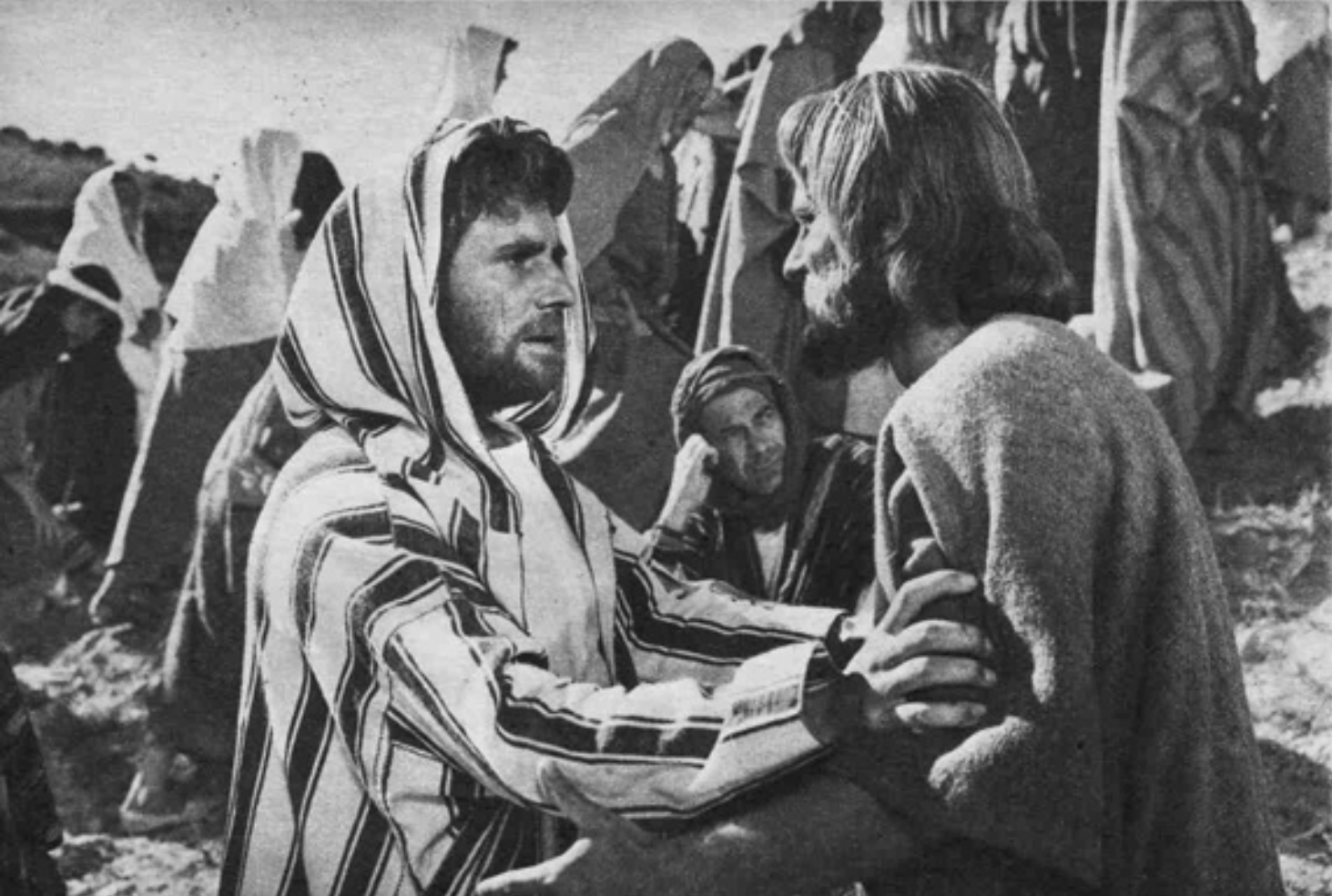
The rebel, Barabbas (Harry Guardino) meets with Judas (Rip Torn) at the Sermon on the Mount

(Continued from previous page) filmed in Spain, has cost $8,000,000 — nearly £3,000,000. No expense has been spared to make it one of the most spectacular and realistic pictures ever filmed.