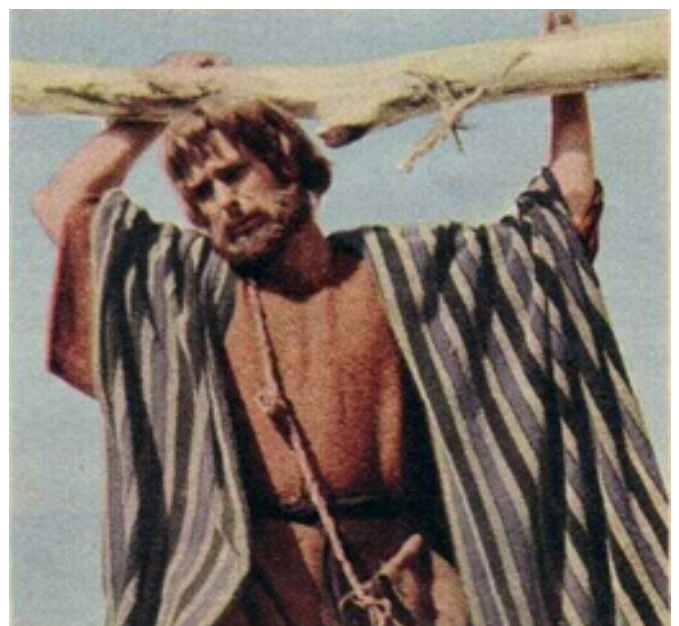
Rip Torn has a key part as Judas, the man who betrayed Jesus