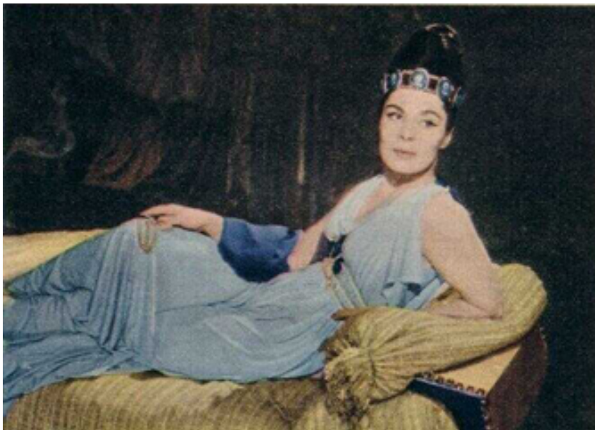
Viveca Lindfors portrays Claudia, the beautiful wife of Pontius Pilate