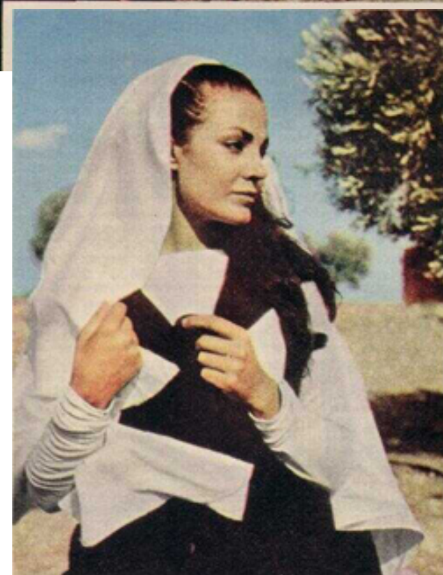
Spanish actress Carmen Sevilla plays Mary Magdalene, sinner converted by Christ

W ITH historical epics, particularly those of a Biblical nature enjoying peak popularity, it was inevitable that, sooner or later, the film companies