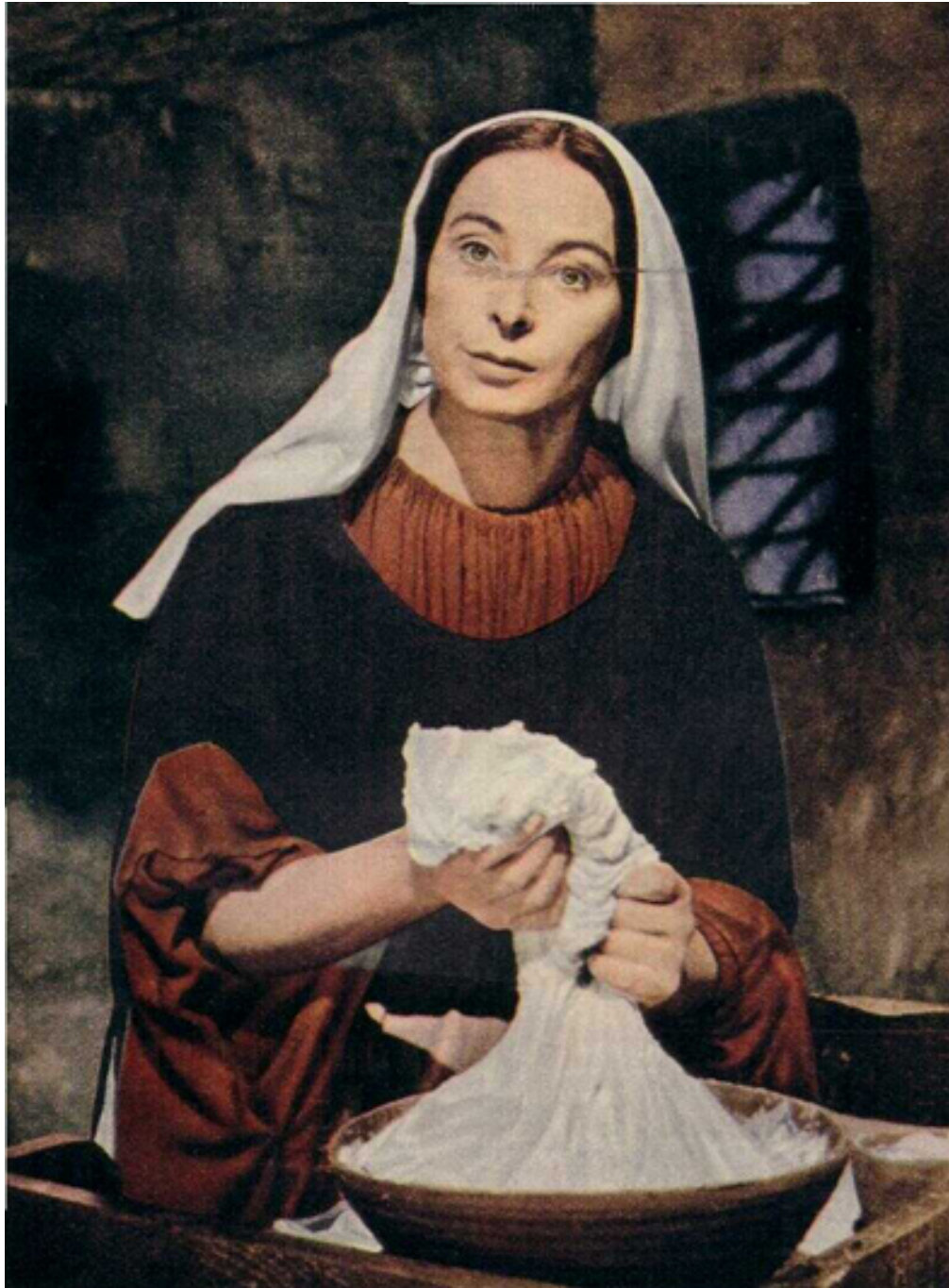
After a long search, Siobhan McKenna was cast as the Virgin Mary