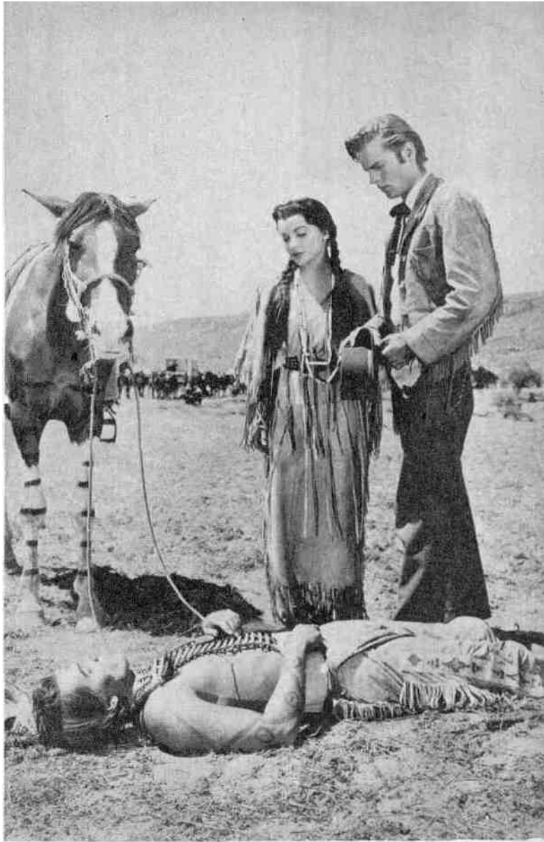
18. Little Dog was shooting to kill. "Bring him down!" ordered the Colonel, no other choice before him. Little Dog fell from his horse. Slowly, Broken Hand gave the signal and the tribe departed. Now the prospectors and ranchers could take over. And Josh could lay out his town site where the wigwams stood. The Indian wars were over.