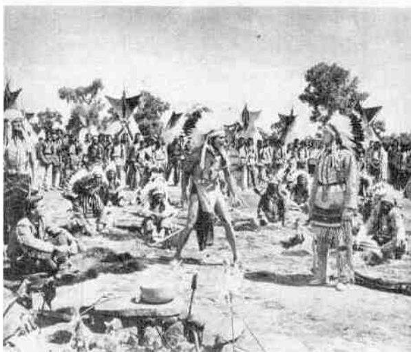
10. First to spring to his feet was Little Dog, son of Broken Hand. "It is better if my white brother goes," he cried. "Things must now be said that cannot be said before him." As Josh left, he could hear the warriors shouting that Broken Hand betrayed them; now they would never make peace.