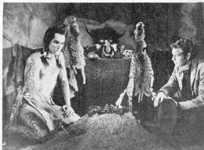
11. Hours later Appearing Day sought out Josh, imploring him to go to Little Dog, son of the chief. Josh went. He found Little Dog in the lodge of the medicine man. To his own suggestion that the south might be a better place to live, Little Dog cried, "Then let the white men go south!"