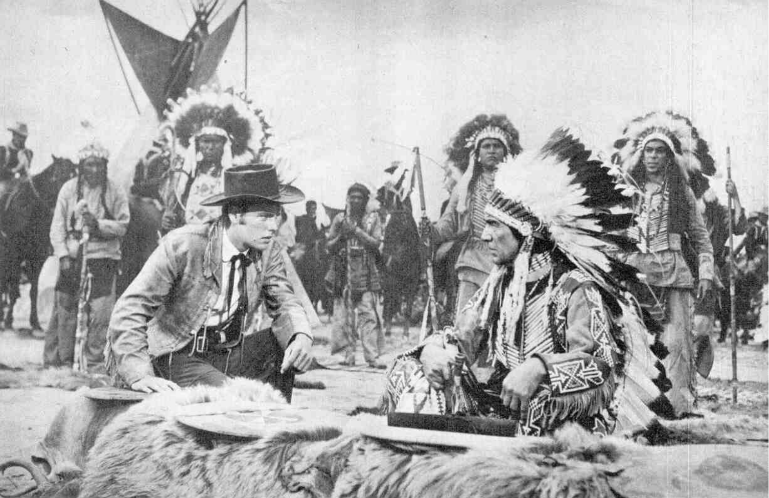
9. At the meeting between Josh and Chief Broken Hand, the aging Indian leader admitted that if the other tribes wanted to give up their land, the Cheyennes could not hold off the white man alone. "Our young men are brave, but if we stay in these hills they will be killed." Josh listened.