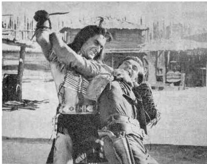
12. What Josh did not know was that his every meeting with Appearing Day had been jealously watched by American Horse (Hugh O'Brian), close friend of Little Dog. Thus he was totally unprepared when American Horse jumped him inside the fort, and only the timely intervention of the soldiers saved his life. The episode did nothing to calm matters.