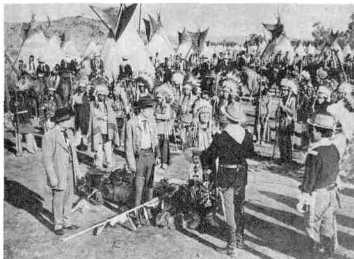
14. It was into an Indian village torn by dissension—young warriors against the old—that the troopers rode a few days later. Was it to be the peace that Josh had negotiated with Chief Broken Hand? Or was it to be the war Josh had inflamed through his innocent meetings with Appearing Day? War—or the white feather of peace? Everyone was tense.