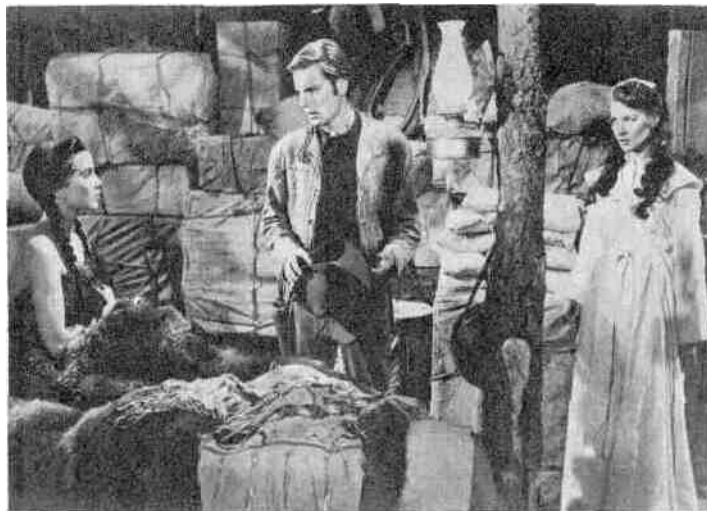
13. The situation was further complicated when Appearing Day, ignoring the 200 horses that American Horse was about to pay for her as a wife, appeared at the fort and trustingly placed herself in Josh Tanner's hands. "Don't go through with this unless you mean it," advised Ann Magruder, concealing her own feelings for Josh. "I know what it is like to be hurt."