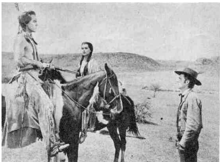
17. "Little Dog, hear me!" It was Appearing Day, riding in where no woman belonged. "He did not take me! It was I who came to him!" Slowly the tenseness left Little Dog. Once more he saw Josh as a brave friend. For the benefit of his tribesmen he leaned over and shook hands. And also for the benefit of his tribesmen he charged.